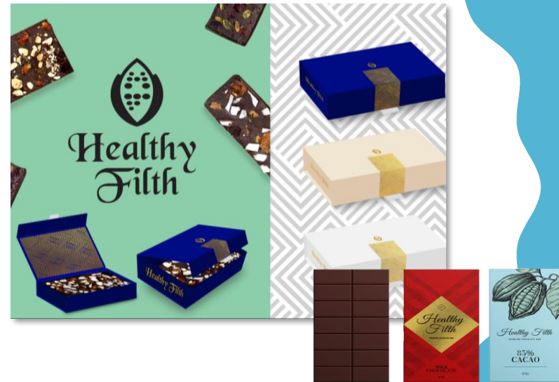
VEGAN CHOCOLATE BAR