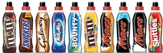
FLAVOURED MILK DRINKS