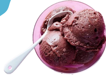
VEGAN ICE CREAM