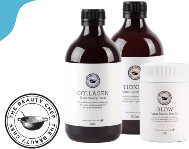
EDIBLE BEAUTY PRODUCTS