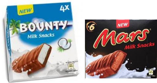
CHILLED MILK SNACKS